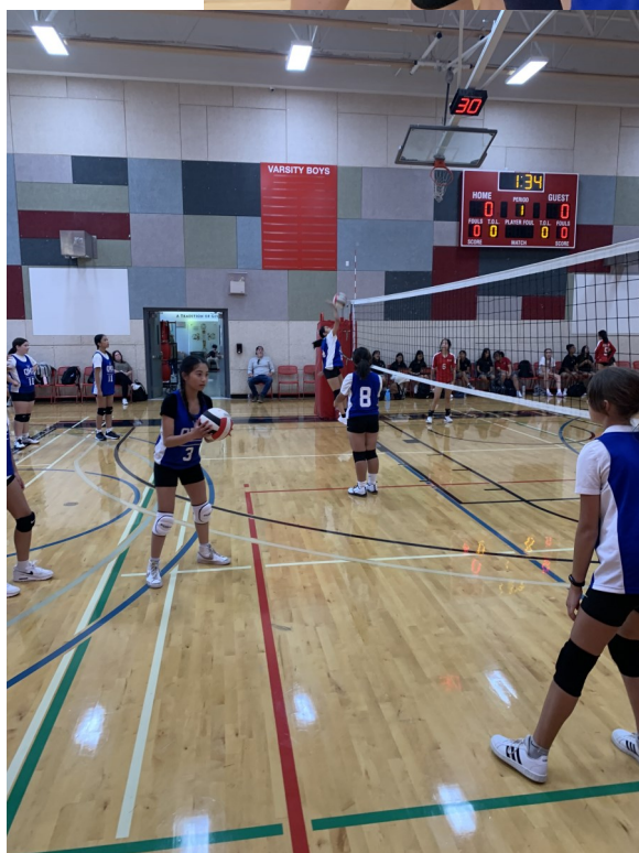
Grade 8 Girls Volleyball games at FRMS & STM